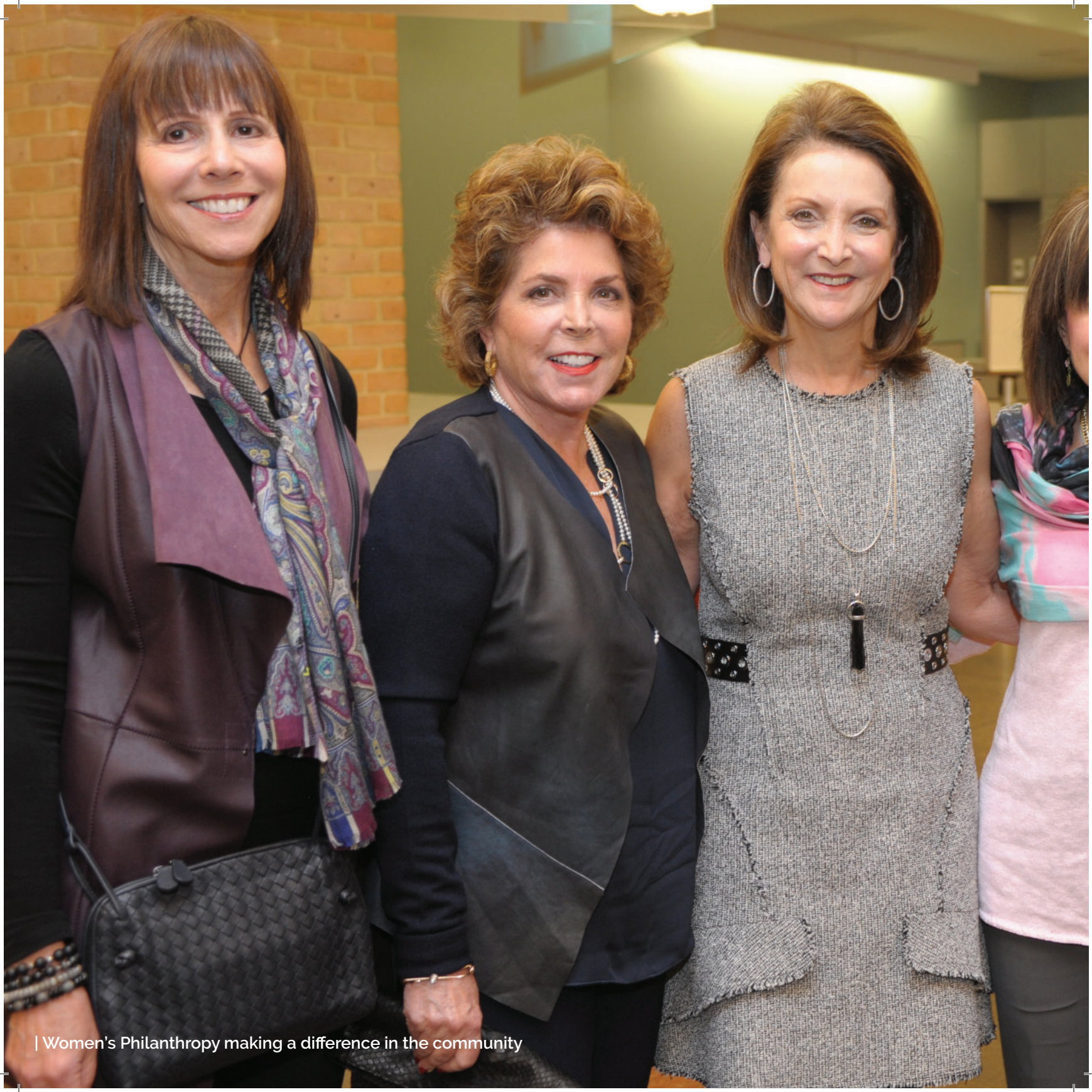
| Women's Philanthropy making a difference in the community