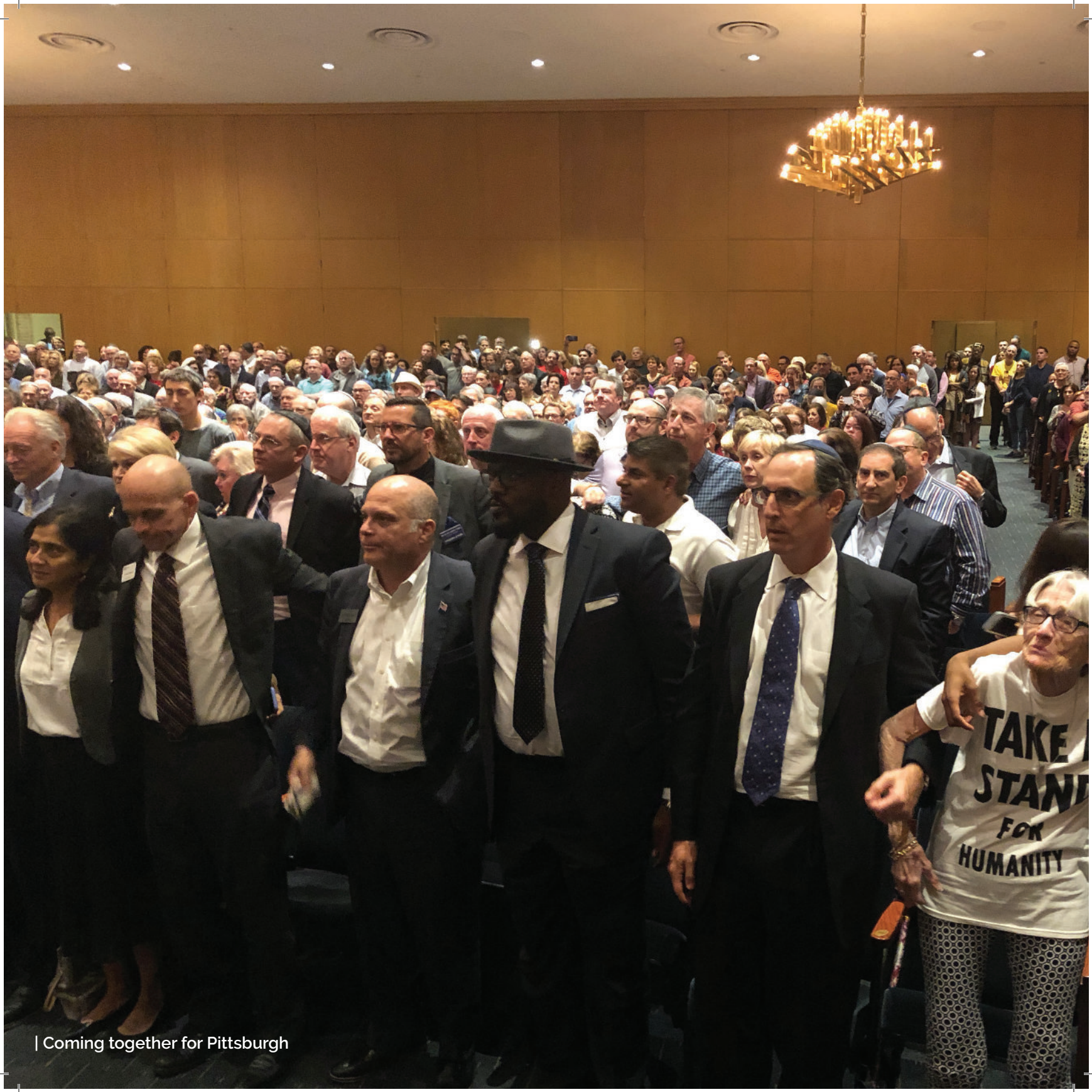
| Coming together for Pittsburgh