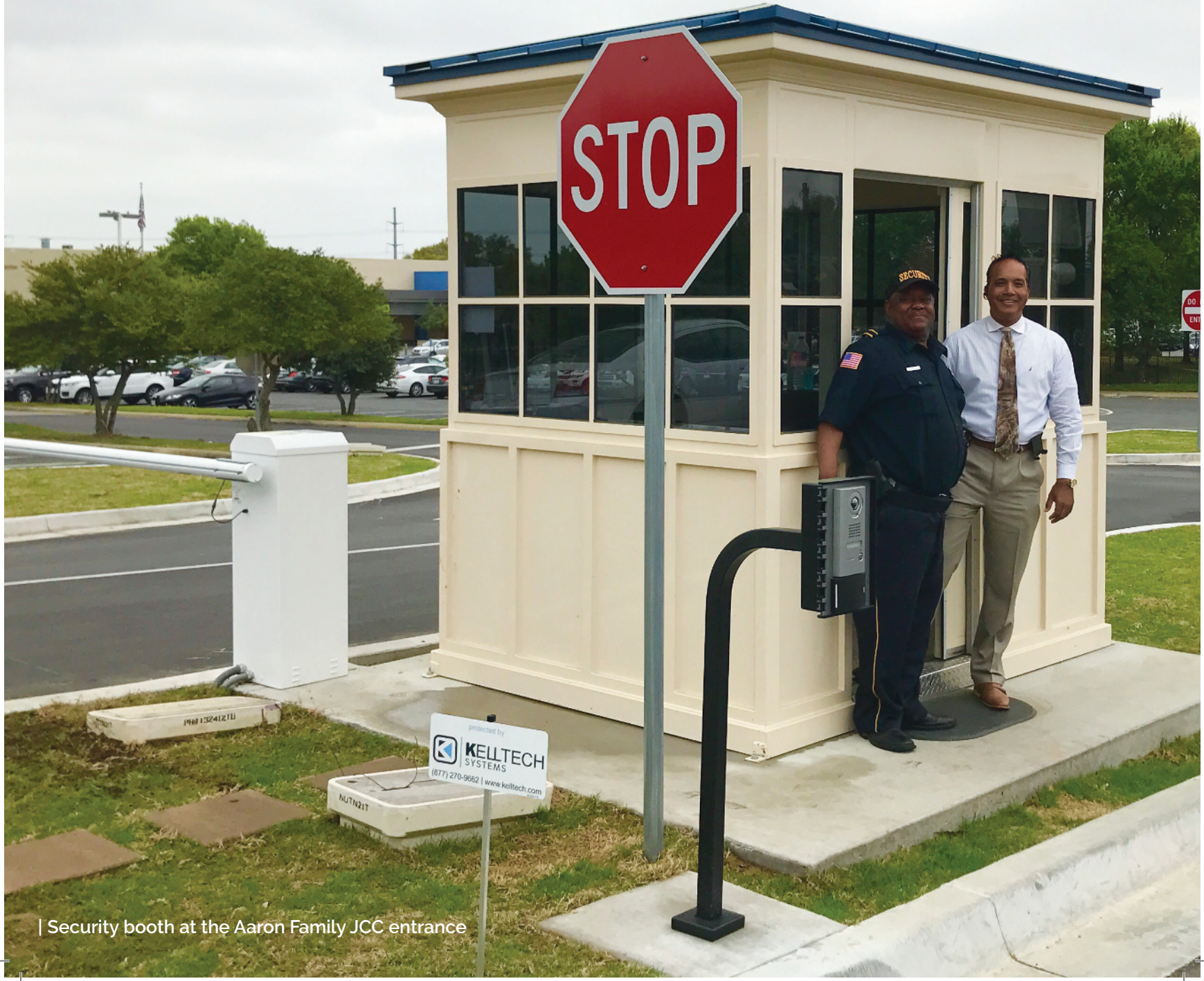
| Security booth at the Aaron Family JCC entrance