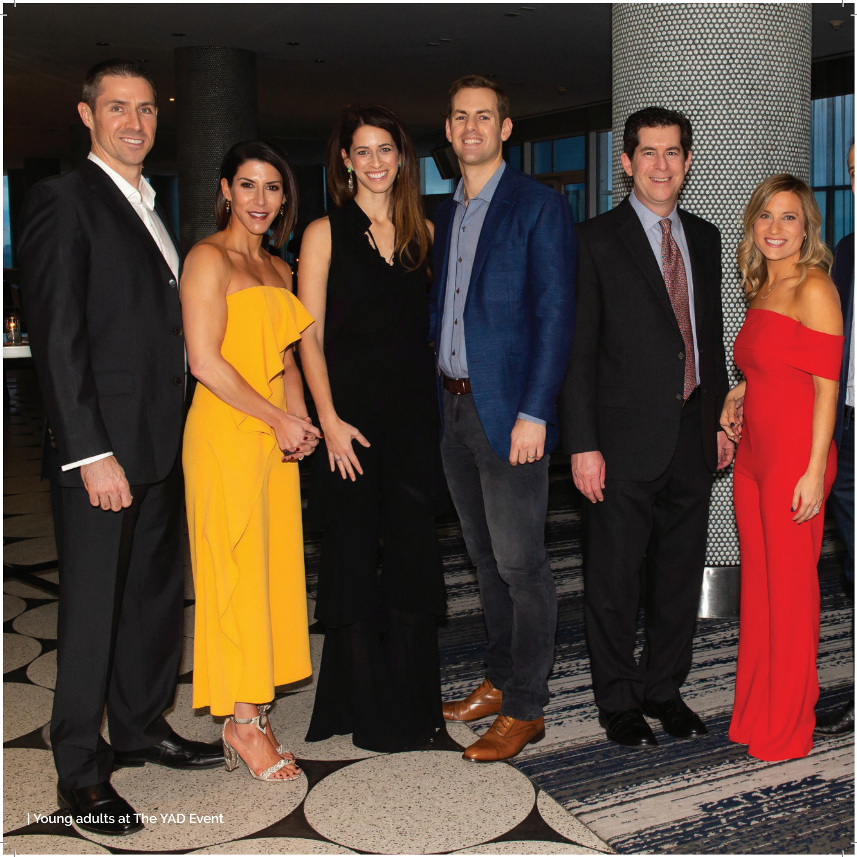
| Young adults at The YAD Event